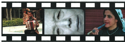
Film stills, Then & Now

PARTICIPATION is published and distributed by Mousse Publishing in major museum libraries globally or to purchase a copy online click here .